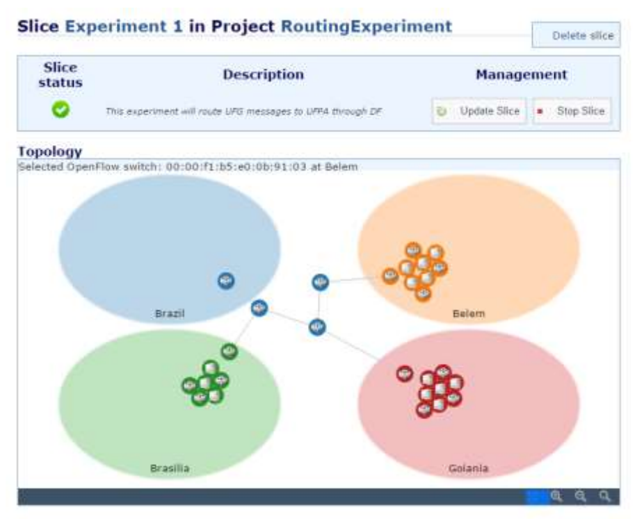
Figure 2. Physical topology of the experiment slice

the resources in the aggregates available to the slice. These resources may comprise the available OpenFlow switches, virtualization servers, and the connections between switches and servers.